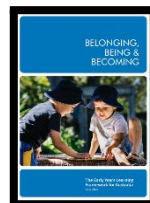
The Early Years Learning Framework 2022 V2 (Belonging, Being & Becoming)