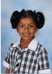
Agasthya Prep C

For always listening carefully and respectfully contributing to class discussions.