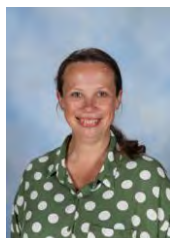
Cass Mental Health & Wellbeing Leader