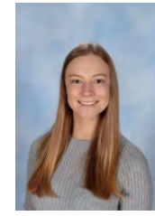
Miss Toll 1/2 C