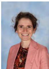
Ms Dwyer Performing Arts