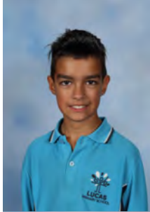
Cohen 3/4 C

For displaying respect during all learning activities, demonstrating whole body listening.